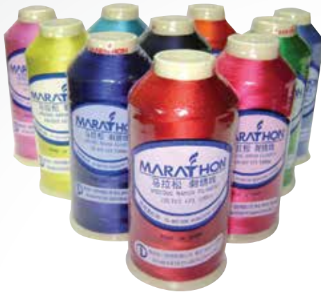
RAYON EMBROIDERY THREAD 40WT 120D/2PLY:

Marathon Viscose Rayon thread is Luxuriously silky in feel yet incredibly strong. It comes in over 400 vibrant colors. Embroiderers worldwide choose Marathon Viscose Rayon to produce a high-end product at an affordable price.