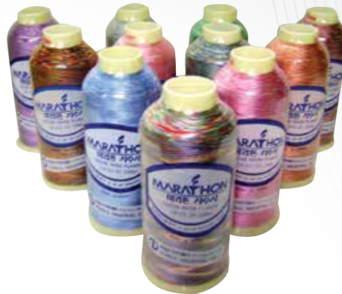
MULTICOLOR RAYON EMBROIDERY THREAD 40WT 120D/2PLY: